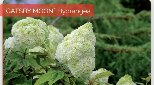
GATSBY MOON™ Hydrangea

Proven Winners® varieties: TUFF STUFF™ series