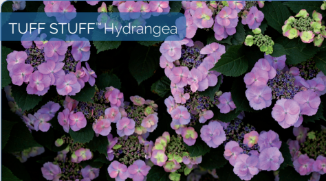
TUFF STUFF™ Hydrangea